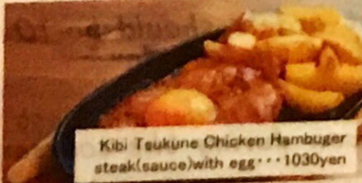
Kibi Tsukune Chicken Hamburger steak(sauce)with egg...1030yen