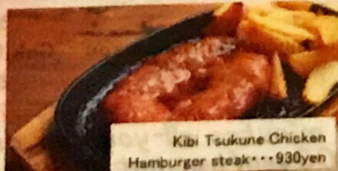
Kibi Tsukune Chicken Hamburger steak...930yen