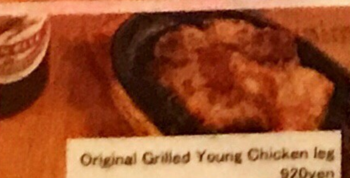
Original Grilled Young Chicken leg 920yen